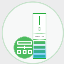
Elegant Modular and Unified Design