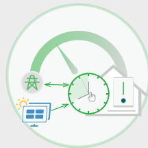
Export Control and Time-of-use Shifting