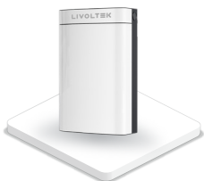
Residential Lithium Battery