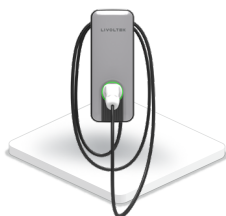
Smart EV Charger