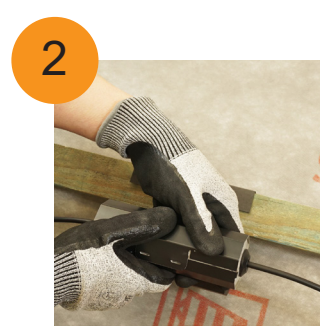
Snap the casing shut