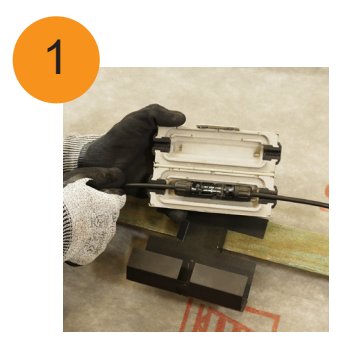
Place MC4 connector into enclosure with cables laid in grommet

BIPV solar installations are one application for the ArcBox since DC cabling is installed near combustible building materials. Flat roof solar installations above roof coverings such as single ply membrane or ashphalt is another. Some buildings, if put out of use even temporarily, would have high knock-on consequences - hospitals, schools, care homes, and factories are applications where risks must be carefully controlled.