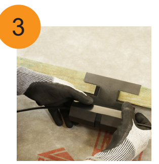
Mounting bracket available for in-roof applications

Independently confirmed by the University of Loughborough Department of Engineering that temperature under load remains within connector manufacturer's guidelines.